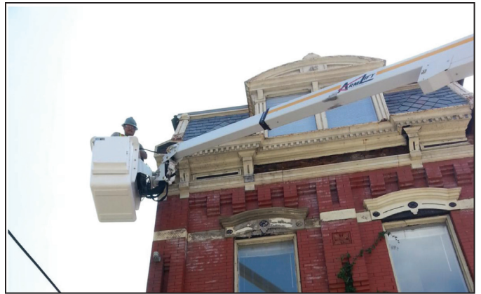
Soft stripping the exterior of a building in South Fairmount