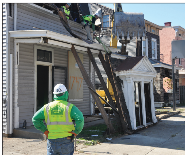
Deconstruction of a building in South Fairmount