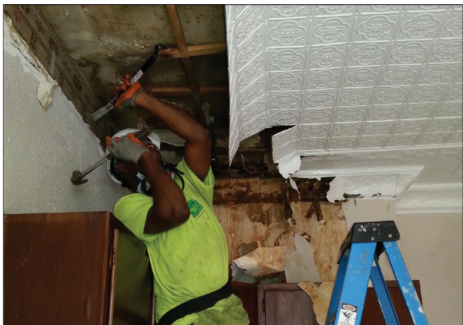
Trainees softstripping buildings for reusable materials