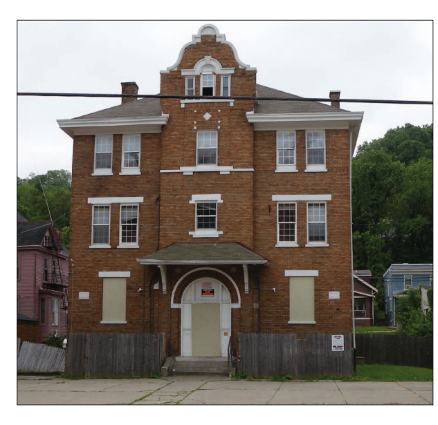
1789 Queen City Avenue (nun's house)