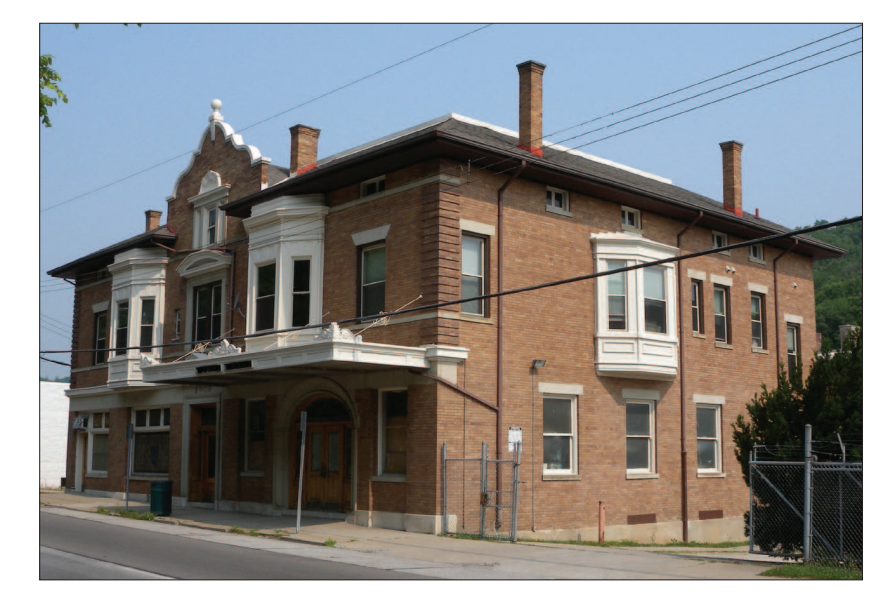
1824 Westwood Avenue (former Vitt & Stermer Funeral Home – Mission style)