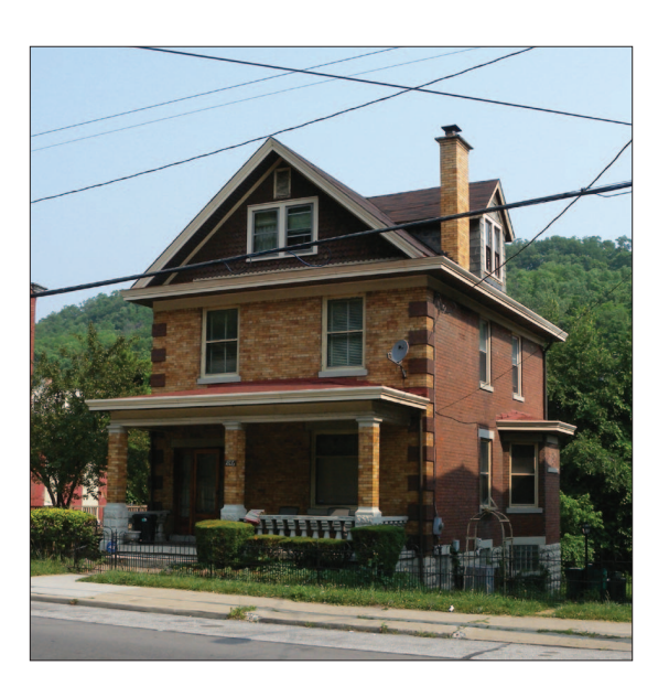
1806 Westwood Avenue (American Foursquare style)