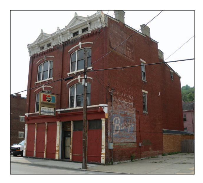
1783 Queen City Avenue (Queen Anne style)