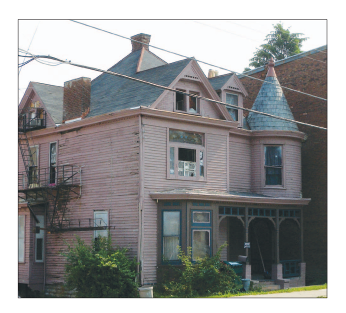
1786 Westwood Avenue (Queen Anne style)