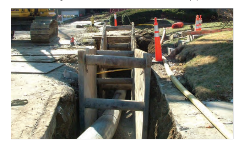
Open Cut Method

The stormwater pipe will be installed using traditional open cut methods. Open cut construction involves digging an open trench in the ground for installation of the sewer pipe.