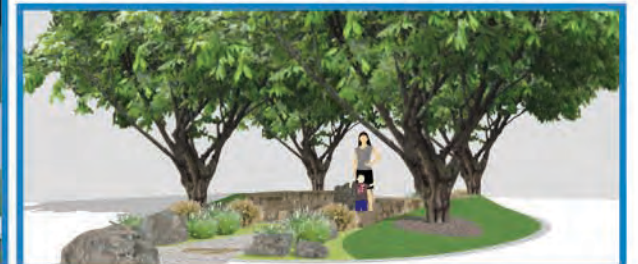
Playground Equipment & Environment