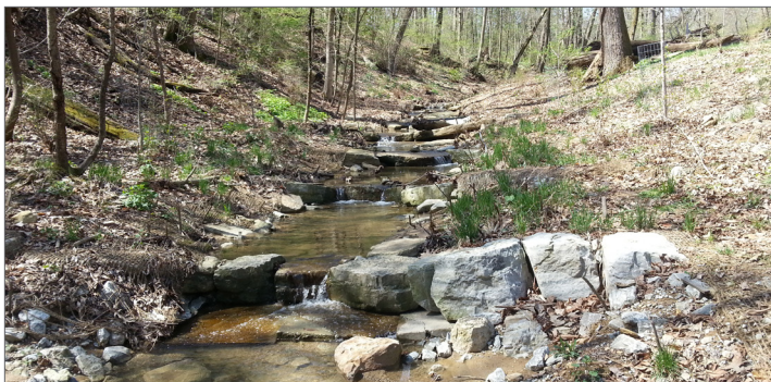
Example of a stream restoration (ledge rock cascade and step pool)

About 113 trees will be removed from the project area prior to construction. However, 229 trees, 177 new shrubs, and 51,000 plants will be planted as part of the project.