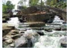
Most preferred images (66% participated in survey)