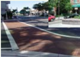
Most preferred images (59% participated in survey)