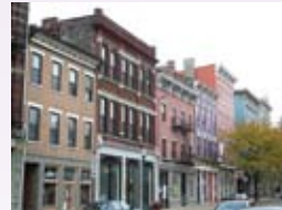
Most preferred images (73% participated in survey)